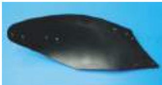
To Replace Gregorie Besson #8 Steel Mouldboards