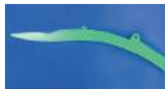
Orbis Small Drum Guide Bar - 4 Required