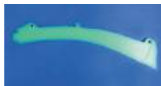
Orbis Inside Bottom Guide Bar - 2 Required