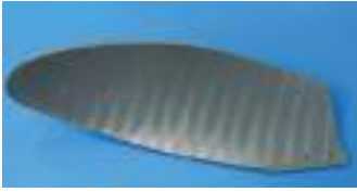
Overum XL Mouldboard (Plastic, Normally Grey in colour with Steel Shin)