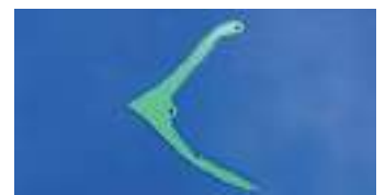
Orbis Stripper Guide Bar - 4 Required