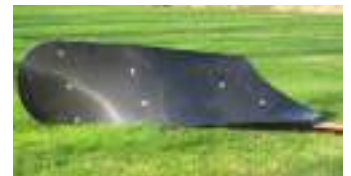
Klough Right Hand (Right Hand Only)