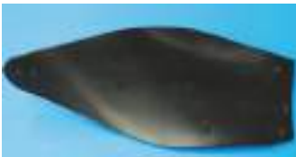
Kuhn H4 Body (Standard Kuhn Plastic Mouldboard (Drilled for Plastic Mouldboard Frog)