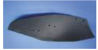
To Replace Kverneland #28 Steel Mouldboards