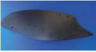
Old style Pottinger Plastic Mouldboard