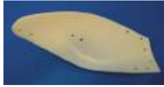
To Replace Kverneland #8 Steel Mouldboards