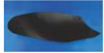
Overum Vee Body Long Mouldboard (Plastic, Normally Black in colour NO Steel Shin)