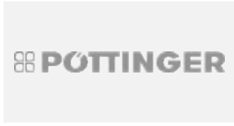
Pottinger 36W Mouldboard