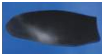
Style Mouldboard to fit Standard Kuhn Mouldboard bolt pattern