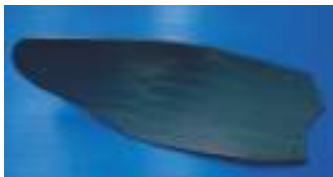
To Replace Lemken W52 Steel Mouldboards