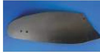
Overum Vee Body Mouldboard (Steel, with Steel Shin)