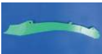
Orbis Inside Top Right and Left Hand Guide Bars - 1 Required