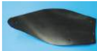
Kuhn H4 Body (Standard Kuhn Plastic Mouldboard (Drilled for Steel Mouldboard Frog)