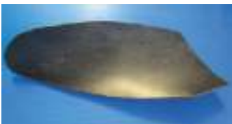
To replace Ransome SCN Body Mouldboard