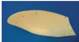
To Replace Kverneland Skeleton Mouldboards