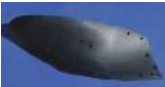
Kverneland #34 Plastic Mouldboard