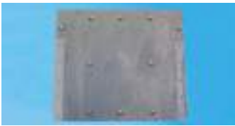
To Suit 10 or 12 Bolt Howard Swing Plough