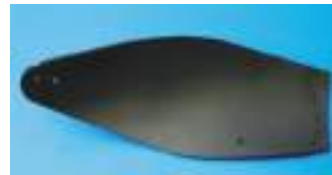
Kuhn H4 Body ( Standard Kuhn Plastic Mouldboard with Overum Twist (Drilled for Plastic Mouldboard Frog)