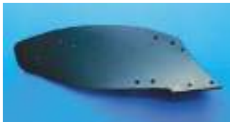
To Replace Gregorie Besson H6 Steel Mouldboards