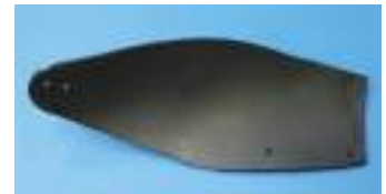
Kuhn H4 Body (Standard Kuhn Plastic Mouldboard with Overum Twist (Drilled for Steel Mouldboard Frog)