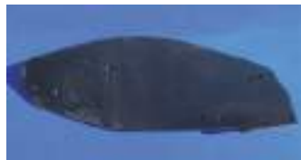
Gregorie Besson H6 Plastic Mouldboard