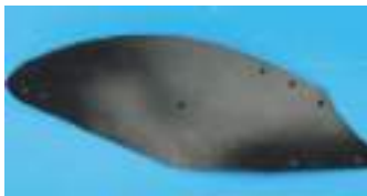
Lemken Europal Plastic Mouldboard