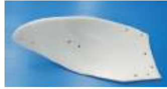
To Replace Kverneland #9 Steel Mouldboards