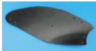
Lemken Variopal Plastic Mouldboard