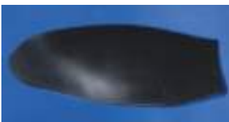
To Replace Kuhn SK Steel Mouldboards