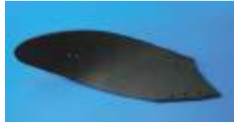
Overum XL Long Mouldboard (Plastic, Normally Black in colour NO Steel Shin)